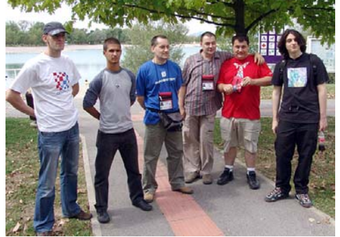
Our Technical Committee