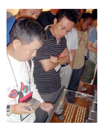
We wish all of you to have a lot of ideas, and the opportunity to share them with the whole world!