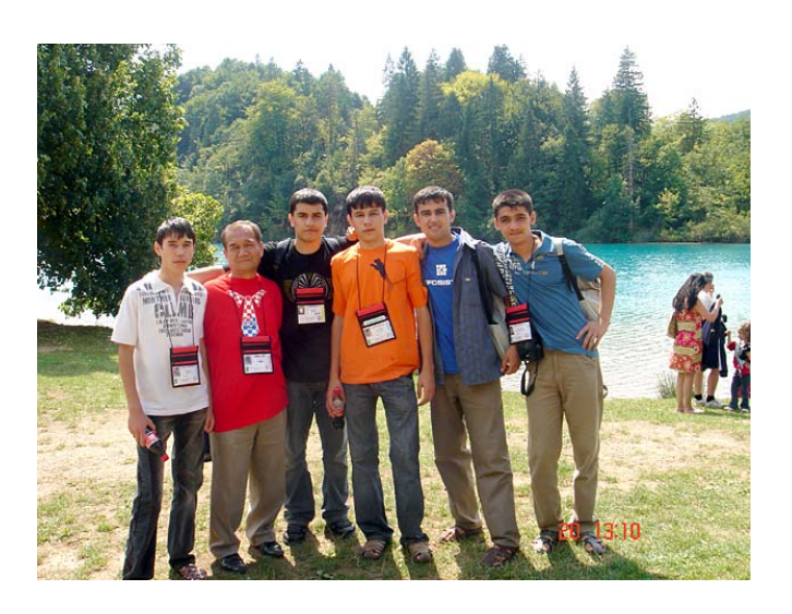
We hope you will remember all the good moments you had in Croatia, and keeping in mind a wise sentence from a wise man " I'm not angry they stole my ideas, I'm sad they didn't have their own ideas". ( N. Tesla )